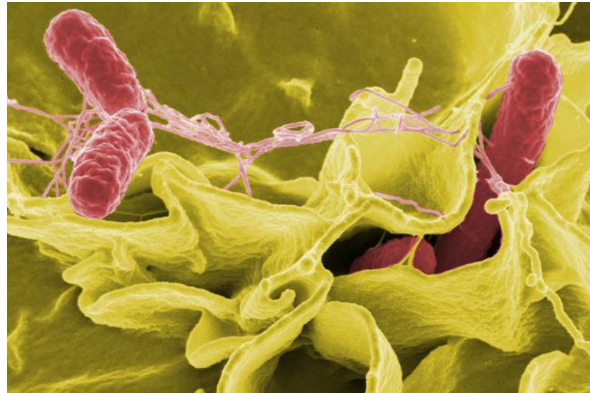
Color-enhanced scanning electron micrograph showing Salmonella Typhimurium (red) invading cultured human cells.

their life or 100,000 people losing 1 year of their life, or another variation. While some of these incidents are caused by unsafe food preparation, gaps in the safety of our food supply contributes to the risk of contamination and increases the number of those affected in the United States every year.