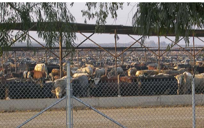
Harris Ranch feedlot in California.

The complicated interconnections and opacity of the food supply chain has made tracking the source of the contamination extremely arduous. It could take weeks to locate the source of an outbreak in something like fruit and vegetables by which time dozens of people could have gotten sick because the food is perishable. Delays risk serious health consequences and point to the need to streamline the process of agriculture supply chain transparency. Transaction information can be vital to containing the public health impacts of contamination.